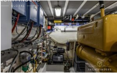
Altena 68 Motor Yacht