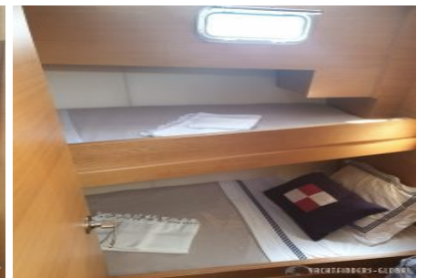
Interior view (Right)