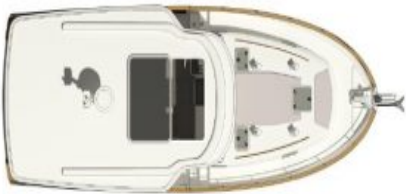
Deck view (Right)