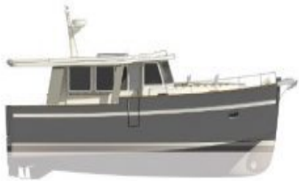
Exterior view (Left)