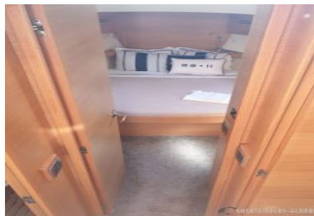
Interior view (Bottom Center)