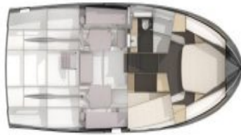
Interior view (Left)