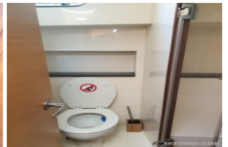
Interior view (Bottom Right)