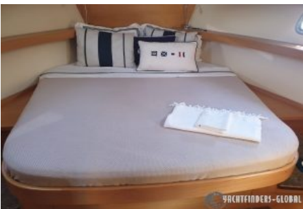
Interior view (Bottom Left)