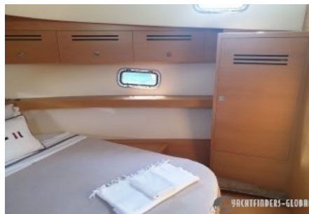
Interior view (Right)